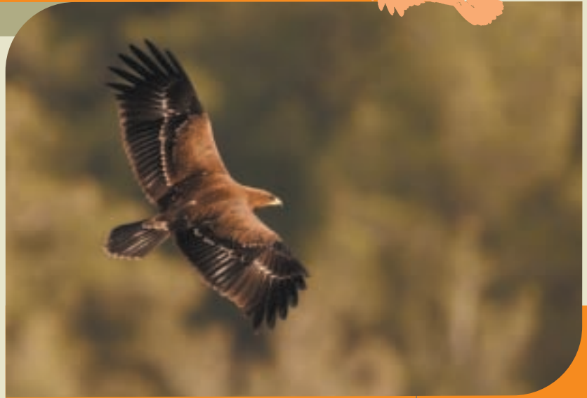
Lesser-Spotted Eagle.

We also spotted 450,000 White Storks and about 60,000 of White Pelicans. Last year we counted the largest number ever of Lesser-Spotted Eagles: 140,000 (a third more than average).