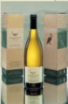
The New Organic Chardonnay

a joint initiative with Ramat Ha'Golan Vineyards