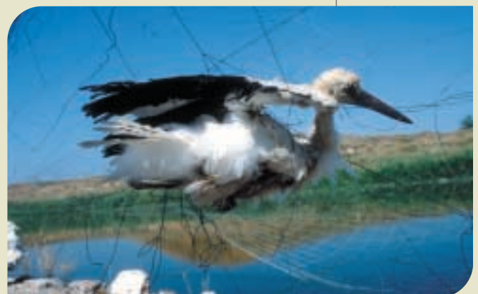
A White Stork caught in a net over a fishpond.

For over ten years a brutal and cruel phenomenon has been going on around fish - ponds throughout the country. Each year, literally thousands of birds from a variety of species are caught in nets that cover fishponds as a protective measure against fish-eating birds. The victims, many of which are not causing any damage to the fisheries, get tangled in the nets and die in a slow and cruel manner. The IOC has been fighting this phenomenon since it began. Two years ago the Israel Nature & Parks Authority issued specific guidelines to the fish - farmers aimed at reducing and preventing these tragic events. Unfortunately, the guidelines have not been implemented, and birds continue to die on a regular basis. Among the many birds trapped are rare and endangered species such as White and Black Storks, Little Bittern, Black Kite, and Kentish Plover. At the end of last year we rescued from one of the nets in the Beit She'an Valley a Bonelli's Eagle, a rare raptor close to extinction in Israel. The Bonelli's Eagle was treated and later released with a satellite transmitter. Unfortunately, we cannot say the same for the Osprey that was rescued from one of the nets- it died soon after his rescue.