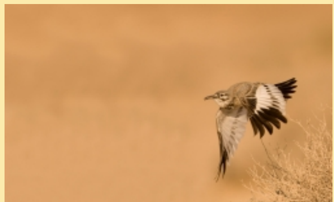
Hoopoe Lark in the Arava

The survey examined the situation of the most sensitive bird species in the desert area of Israel. In the Arava the following species were defined: Hoopoe Lark, Arabian Warbler, Nubian