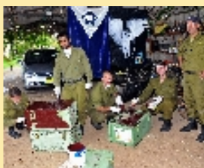
Soldiers contribute to the community by changing ammunition boxes into nesting boxes in the carpentry on Moshav Ram-On.