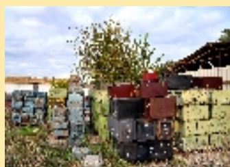
The Israel Military Industries donated 1000 ammunition boxes that were adapted to nesting boxes for Barn Owls and Kestrels.