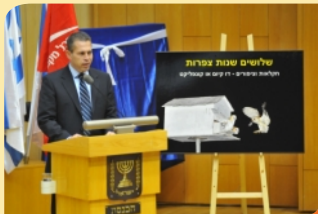
The Environmental Protection Minister, Gilad Erdan, speaking to the 400 guests at the Knesset.

The discussion dealt with ways to decrease the use of pesticides and poisons in agriculture. This was the result of intensive work done by the public committee chaired by the retired High Court judge, Jacob Tirkel, who, for several months, investigated the serious situation in Israel including 120 illegal poisonings in 2009. According to a report by the Israel Nature and Parks Authority, criminal charges were brought against only 3 of the cases. Five committees were set up: one that deals with the enforcement issues, led by former Police Commissioner Assaf Hefetz, the second deals with legislation and is headed by Dr. Jonathan Lester, the third deals with the subject of poisons and their effect on water resources,