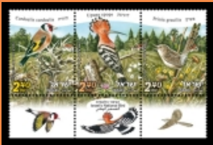
3 new stamps of the Hoopoe, the National Bird of Israel, and the runners-up, the Goldfinch and Graceful Warbler, with the first-day envelope which came out on 26 January, 2010. $10 including P&P