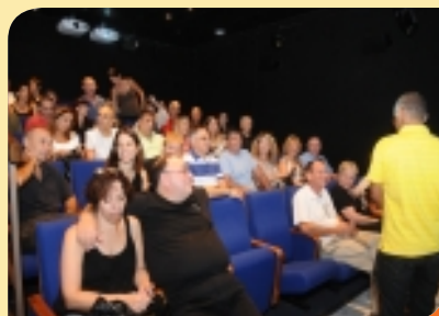
The General Staff forum in the Schiff House auditorium. Bottom right is the Mayor of Tel Aviv, Mr. Ron Huldai. The project is a joint venture sponsored by Discount Bank.