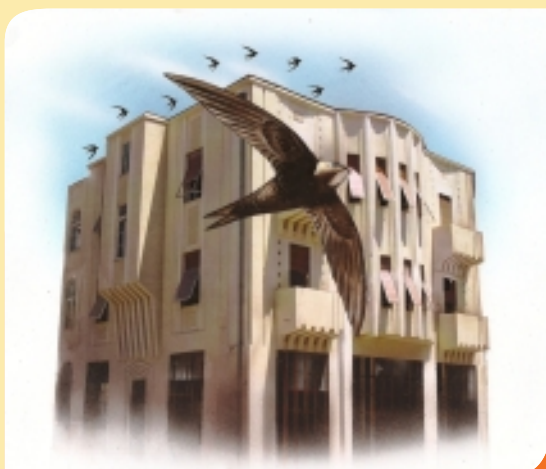
The Common Swift nests in Schiff House in the window shutters, and on-line cameras were installed in the Swifts' nests in order to broadcast the nesting process to visitors and the general public. The Common Swift is the symbol of Tel Aviv, the "White City", a World Heritage Site. Drawing: Tuvia Kurtz.

The project was a unique cooperation among the SPNI, The FRIENDS OF THE SWIFTS Association, Tel Aviv City's Conservation Dept. and the Discount Bank, which also sponsored the project. It was carried out successfully in the unique 100 year-old building named the Schiff House, which was completely renovated by Discount and now serves as a special Visitor's Center for Tel Aviv history. Our installed C.C. Cameras provided live recordings and internet broadcasting of a swift family with 2 chicks from incubating, through egg hatching, growing up, their unique "push up" practice before leaving and of the maiden flight at night. A short film clip, called "Swift City", about the project is being shown to all visitors at the Schiff House and can be seen and downloaded. Check out the SPNI and the FRIENDS OF THE SWIFTS websites.