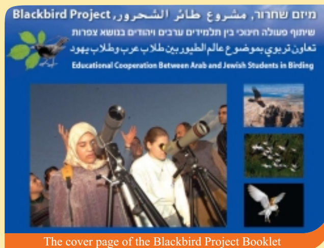
The cover page of the Blackbird Project Booklet

With the help of an anonymous donation the International Center for the Study of Bird Migration at Latrun published a booklet with five lesson plans for elementary school students on birds in the garden, bird migration, Barn Owls and Kestrels as biological pest controllers in agriculture, Griffon Vultures that are an endangered species in Israel, and a chapter on birds in the Bible and the Koran. Eight Jewish schools and eight Arab schools all over the country joined the project enthusiastically. Birdwatching trips of one to two days are planned for the Arab and Jewish schools together and a Hebrew-Arabic-English dictionary containing 100 basic words has been produced to improve communication among the students. The booklet has been printed with the Hebrew pages on the right and the Arabic pages on the left. A DVD with many illustrations has also been produced. We are planning to hold a big event in May 2010 to celebrate the first year of activity.